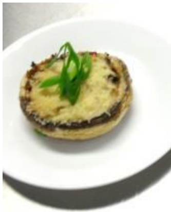
Entree - Stuffed Mushroom