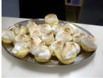
Dessert - Baby Lemon Meringues