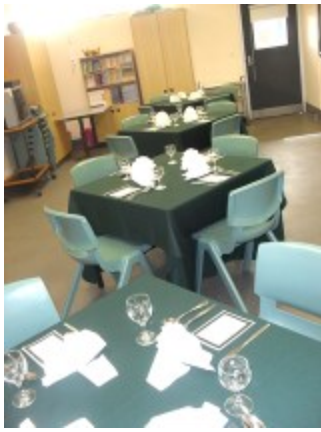
Table setting prior to function