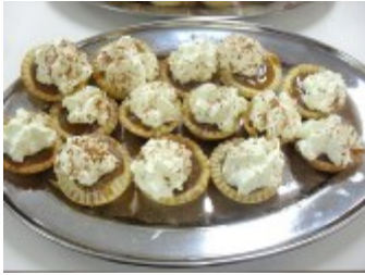
Dessert - Baby Caramel Slice

The four girls had to work together to produce 16 servings for the entrée, main and dessert. This required teamwork, cooperation, organisation and coordination. They also had to complete individual tasks throughout the duration of the day to meet all the requirements set out in the assessment events. The tasks were arduous and time consuming however this did not faze the girls, and they just took it in their stride and worked extremely hard with limited breaks to complete all practical tasks. The girls set the dining room, greeted and seated their guests, read out the menu, served drinks, prepared, plated and served each course, cleared tables whilst constantly cleaning throughout. At the end of service, the staff who participated as guests, evaluated each girl and provided feedback on their hospitality skills. One staff member stated 'the girls presented three amazing courses that demonstrated great food preparation skills plus the flavours were tantalising and of highest restaurant quality.' They received many positive comments and accolades for their presentation and professionalism on the day. Well done girls you all were amazing. Kirsty Ebzery